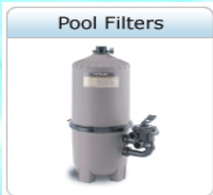
Filter to WaterBond fitting

Begin the normal plumbing installation of the water pipe from the pool to the filter, except install the WaterBond™ fitting between the pool and the filter, or anywhere in the plumbing line. Ensure the fitting is installed so the metal is fully submerged in the water and in contact with the water in the line.